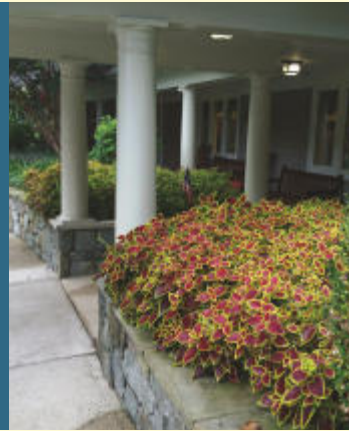
Byron House 9210 Kentsdale Dr Potomac, MD 20854 (301) 469-9400