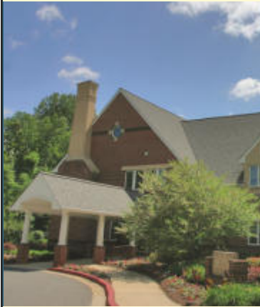
Bartholomew House 6904 River Road Bethesda, MD 20817 (301) 320-6151