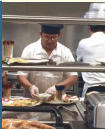
Raphael House 1515 Dunster Road Rockville, MD 20854 (301) 217-9116