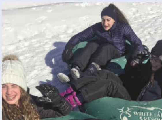
7th Grade Friendships form while Tubing