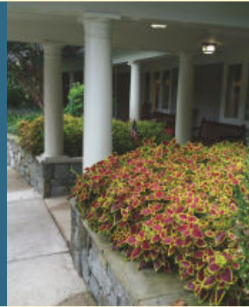
Byron House 9210 Kentsdale Dr Potomac, MD 20854 (301) 469-9400