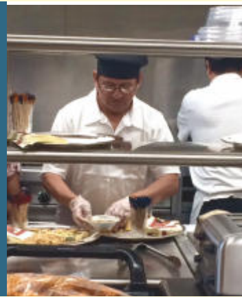
Raphael House 1515 Dunster Road Rockville, MD 20854 (301) 217-9116